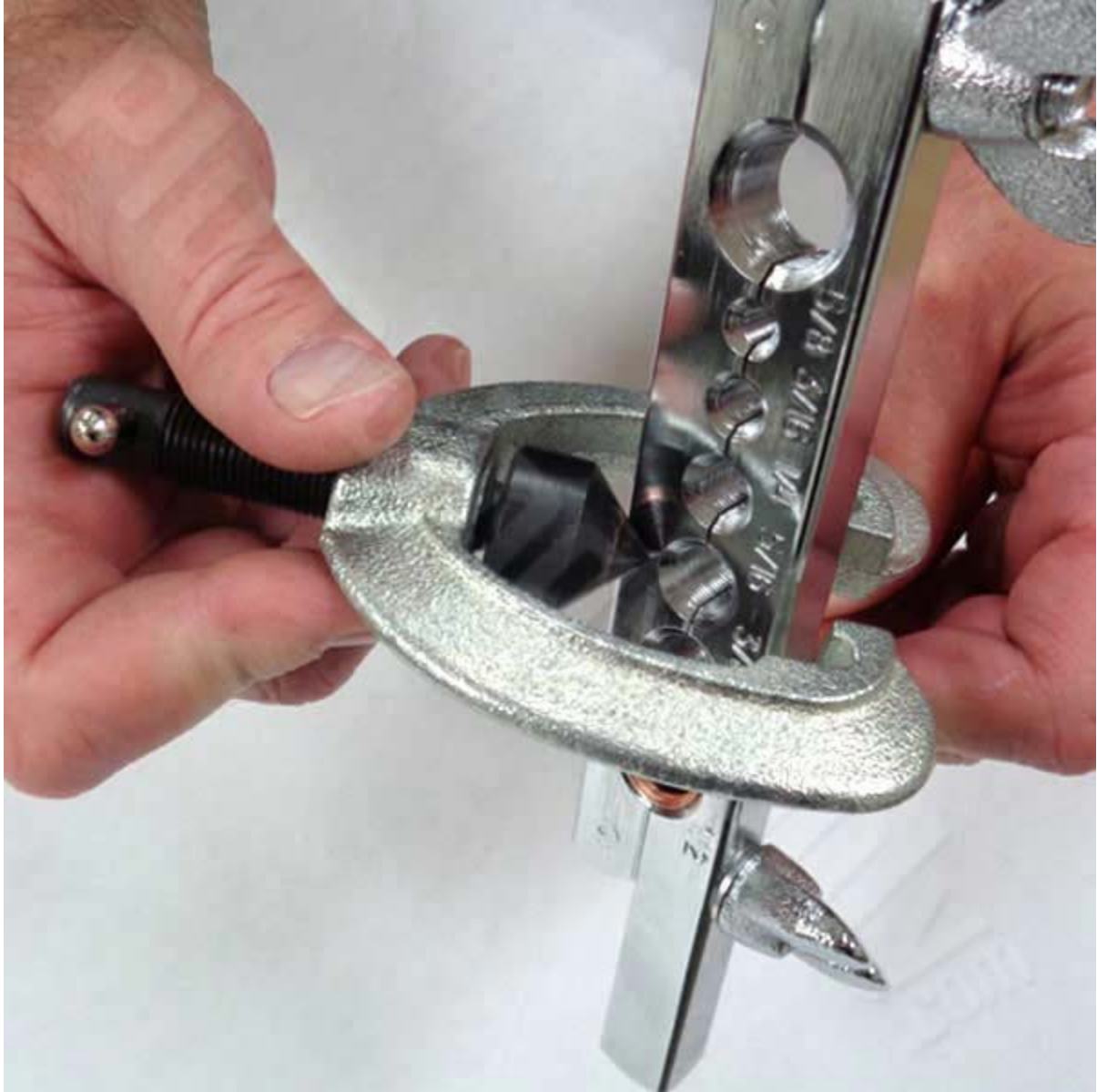
Step 10: Back the cone out and take off the yoke.