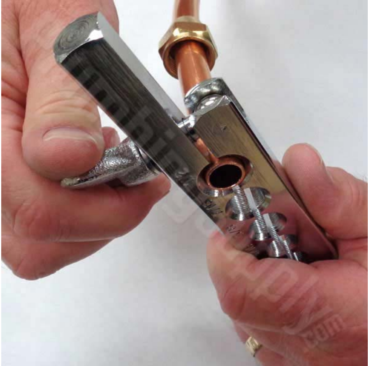
Step 5: Tighten the wingnut closest to the pipe first.